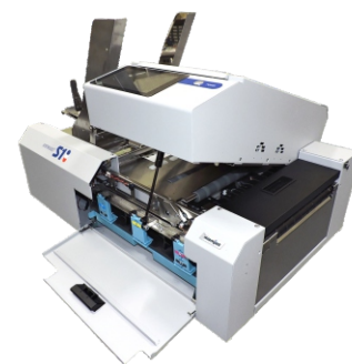
Easy to maintain: Quick access for fast cleaning and service