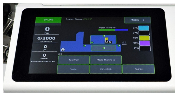
Easy to use: Large touchscreen provides full printer control and system status!