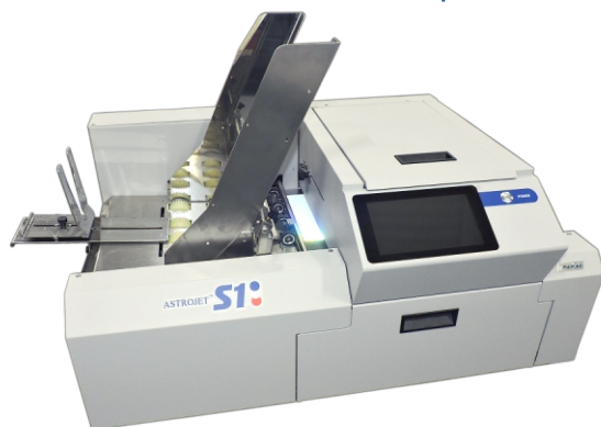
Economical to operate: Fast full-color prints at low cost per piece.

Specifications are subject to change without notice.