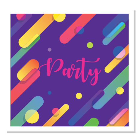
Pro9542 System 5-Colour Digital Printing (CMYK + White, CMYK over White in 1 pass)