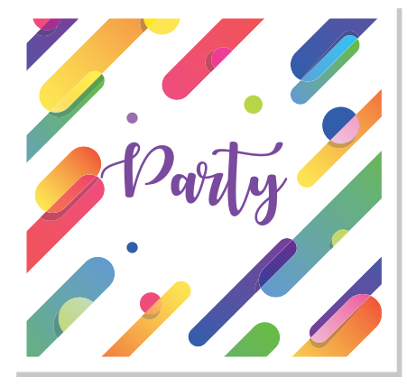
Pro9431 System 4-Colour Digital Printing (CMYK)