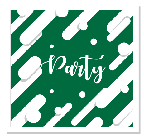
Pro9541 System 5-Colour Digital Printing (CMYK + Clear or CMYK + White)